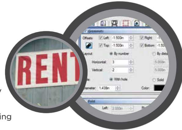
Banner & Canvas Finishing Tools