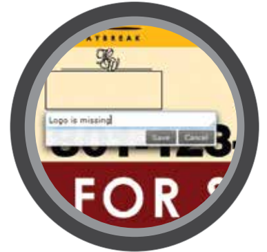
Automated Artwork Approval Tool