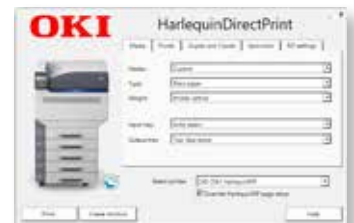
Harlequin MultiRIP 10