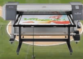
ValueJet 1608HA-64" Hybrid